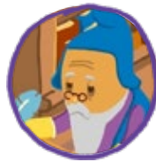
The Wizard Miranda's Father