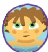
Miranda The Wizard's daughter