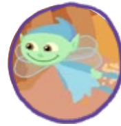
Ariel A Fairy